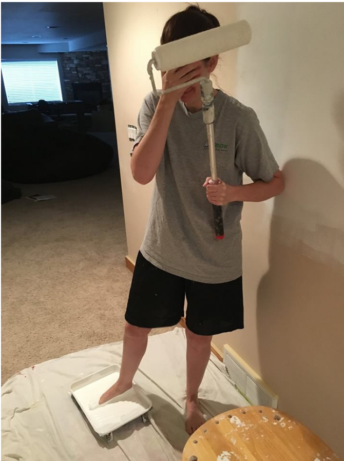
What NOT to do while giving service to the elderly.

A man visiting a rural Tennessee town during the Christmas season saw a wonderful "Nativity Scene," but one feature bothered him. The three wise men were carrying heavy canvas hoses, and wearing fire helmets.